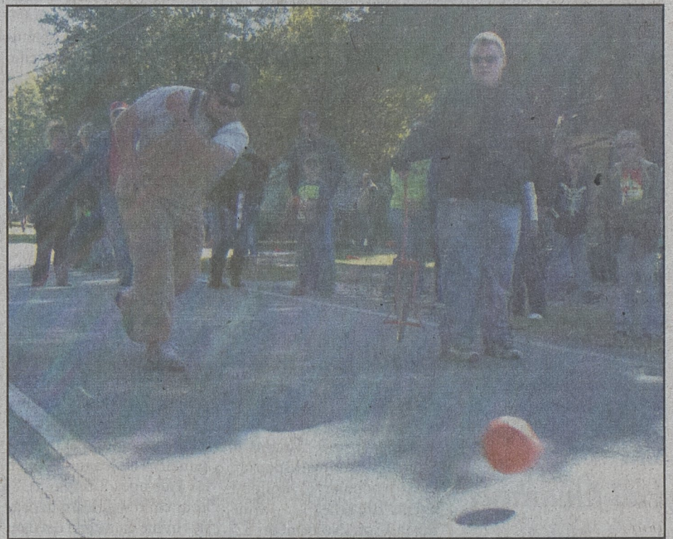
Above: A participant lets one fly in the Pumpkin Roll on Saturday at the Grover Pumpkin Festival. The object was to roll a miniature pumpkin farther than others. The winner notched a distance of just under 200 feet.

*AM BEST 2011 Combined Lines PC. Products underwritten by Nationwide Mutual Insurance Company and Affiliated Companies. Home Office: Columbus, OH 43228. Subject to underwriting guidelines, review, and approval. Products and discounts not available to all persons in all states. Nationwide, Nationwide Insurance, the Nationwide framework, Nationwide is On Your Side and I join the Nation are service marks of Nationwide Mutual Insurance Company. © 2012 Nationwide Mutual Insurance Company. All rights reserved. NPO-0619C (09/12)