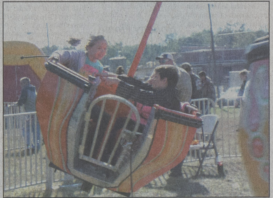
Below: Kids have a thrilling time on the Tilt-A-Whirl at the Grover Pumpkin Festival on Saturday under sunny skies and cool weather.