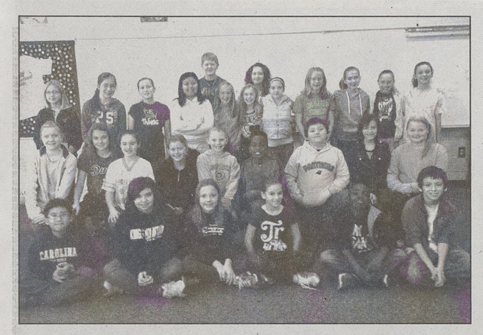
KMIS students above collected food and donated it to the Kings Mountain Crisis Ministry.