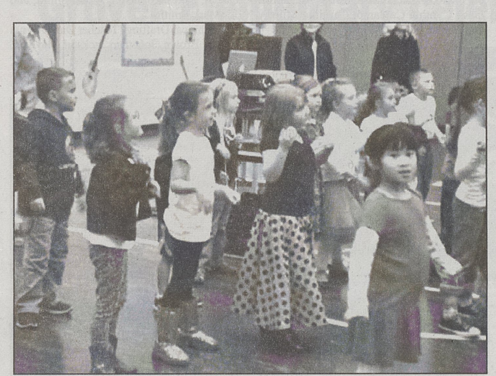
50s Day at West

homeroom class, which collected 200 cans. The Crisis Ministry was astonished and grateful when they saw how many cans had had been brought in, according to students involved in the food