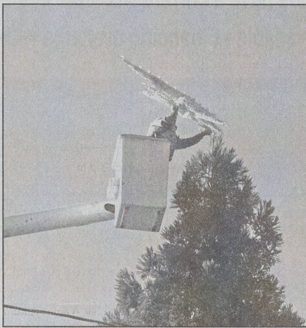
A worker from a local landscaping company maneuvers a new star into place at the top of the Christmas tree at Mauney Memorial Library downtown last Wednesday. Santa Claus helped the library switch on the lights for the tree during a visit Monday evening.

For more information about entering the parade and to see an application, please visit http://www.city-of-km.com/info_app.asp .