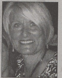
Margot Plonk Foothills Farmers Market