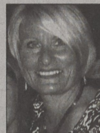
Margot Plonk Foothills Farmers Market

Use them in gazpacho or in a colorful tomato salad with another favorite, pink Brandywine tomatoes. Green zebras, with yellow and green stripes also add some color to the bowl.