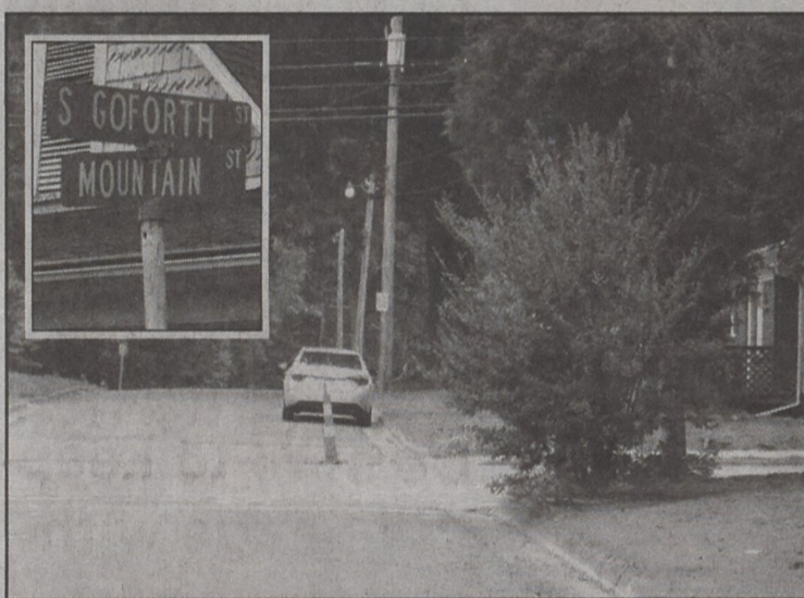
A stop sign hides in this bush at the corner of Mountain and Goforth Streets. Motorists who travel this road often may stop because they are familiar with the road. But what about those drivers unfamiliar with the road who don't? An accident waiting to happen?