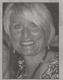
Margot Plonk Foothills Farmers Market