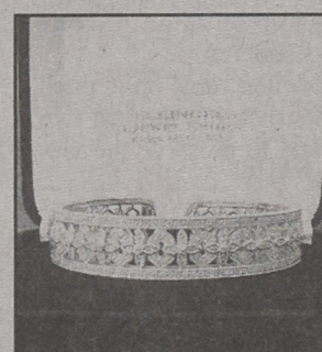
Stunning diamond bracelet from Dellinger's Jewelry

For more information about the exhibit, call the GWU School of Performing and Visual Arts at 704-406-4656.