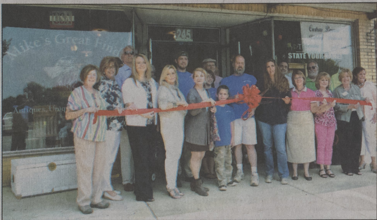
The Cleveland County Chamber of Commerce held a ribbon cutting recently at Mike's Great Finds new location in downtown Kings Mountain.

Fidelity Bank has a local bank in Kings Mountain.