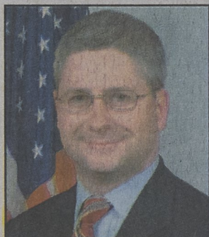
Patrick McHenry US House - 10th District