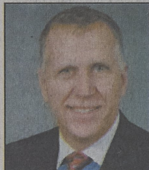
Tom Tillis US Senate