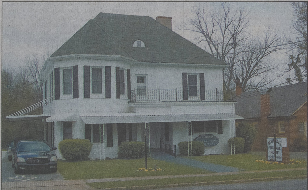
Withrow Funeral Home held their Grand Re-opening this past Sunday.