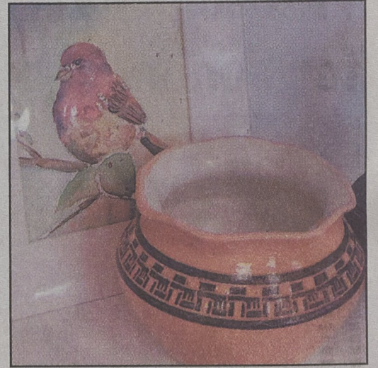
Items available in the Art For Christmas gift shop.