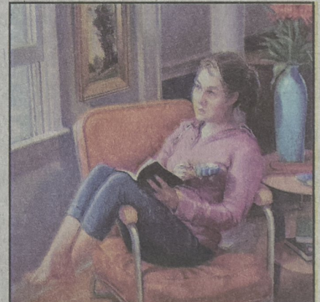
(Pictured right) BE STILL AND KNOW (oil) by Todd Baxter