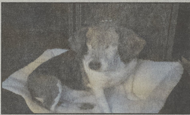
Libby, a deaf and blind beagle, was found decapitated on April 30. Police and Cleveland County Animal Control are seeking information about the crime.

An anonymous donor gave Tri-County Animal Rescue Inc. $5,000 to start the fund. The reward has grown to $20,000 for information leading to the arrest and conviction of the persons or persons responsible