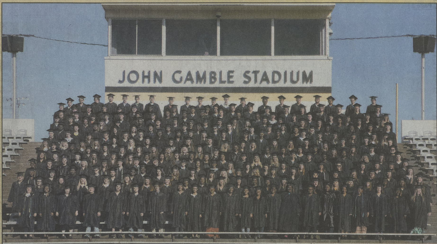
KINGS MOUNTAIN HIGH SCHOOL CLASS OF 2015