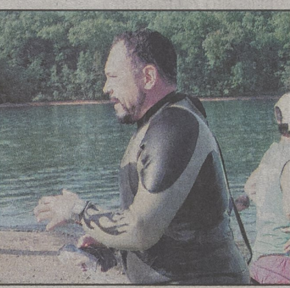
A participant emerges from Moss Lake after the swimming portion of the event.