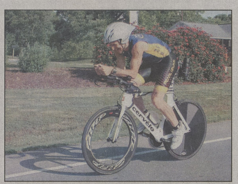
A cyclist on Stony Brook Rd. is about three miles into the biking portion of the OTM Saturday morning.