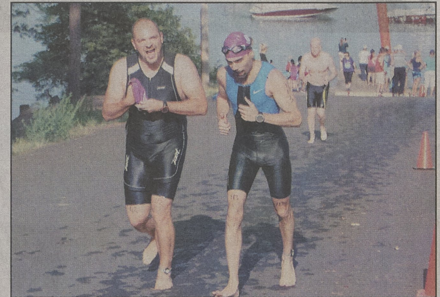
Triathletes make their way up a steep hill after finishing the swimming segment at Saturday's Over the Mountain Triathlon.