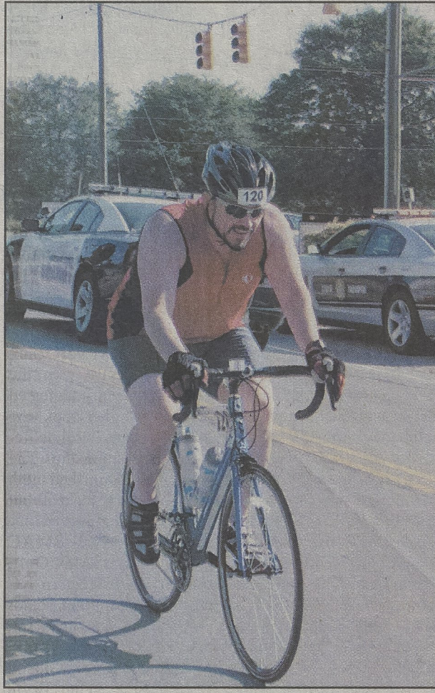
A cyclist makes his way down a road in the Oak Grove section of the 16th annual triathlon.