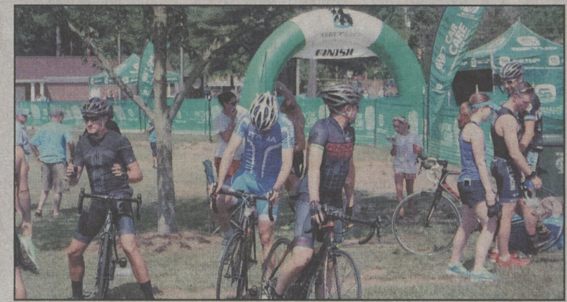
Bikers join spectators, friends and family near the finish line of Saturday's big race, which wrapped up around noon.