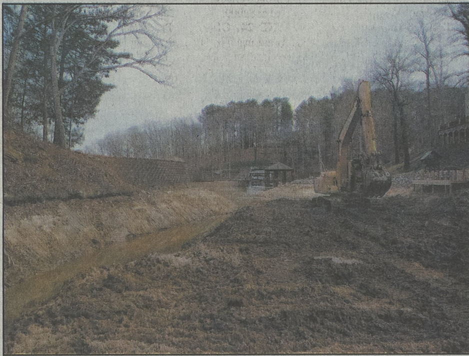
DREDGING UNDERWAY AT MOSS LAKE - The two photos show city workers dredging in an area on Buffalo Creek known as the city's "mining area" because it was permitted to occur with a state mining permit. While the water was down for spillway repairs city forces removed over 1,000 tons of silt. With the purchase of a new backhoe, the city can be even more proactive, according to Mayor Rick Murphrey.