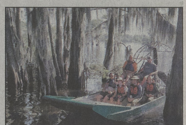
Scouts are on air boats, pictured, as they enjoy an exciting trip.

After attending Sunday School at Parkview the group left for Lafayette, LA and Vermillion Ville Historic Park. There they toured housing and living history of the late 1700's Arcadian culture. Housing on Sunday was at the University of Louisiana, Lafayette where they ate Poor Boy