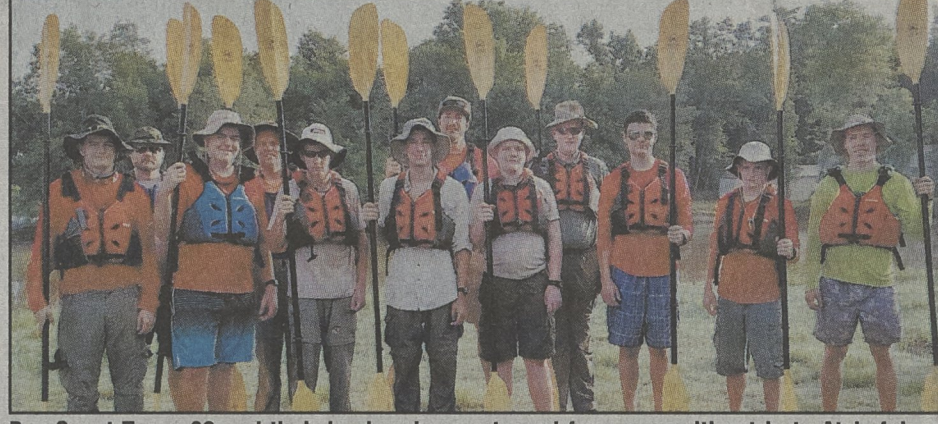
Boy Scout Troop 92 and their leaders have returned from an exciting trip to Atchafalaya Swamp Base in Louisiana.

Boy Scout Troop 92 visit Atchafalaya Swamp Base, LA