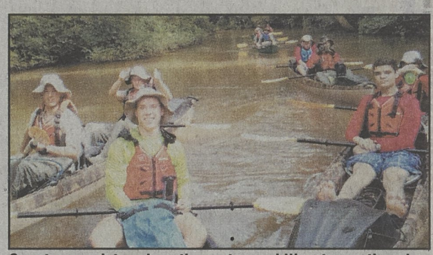
Scouts are pictured on the water paddling to another des-

sandwiches, met their crew guide, and prepared for an early morning departure to the Atchafalaya Swamp.