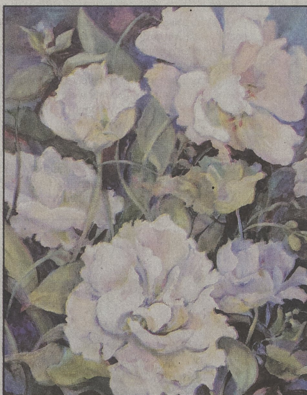
Bountiful by Susan Carlisle Bell - acrylic