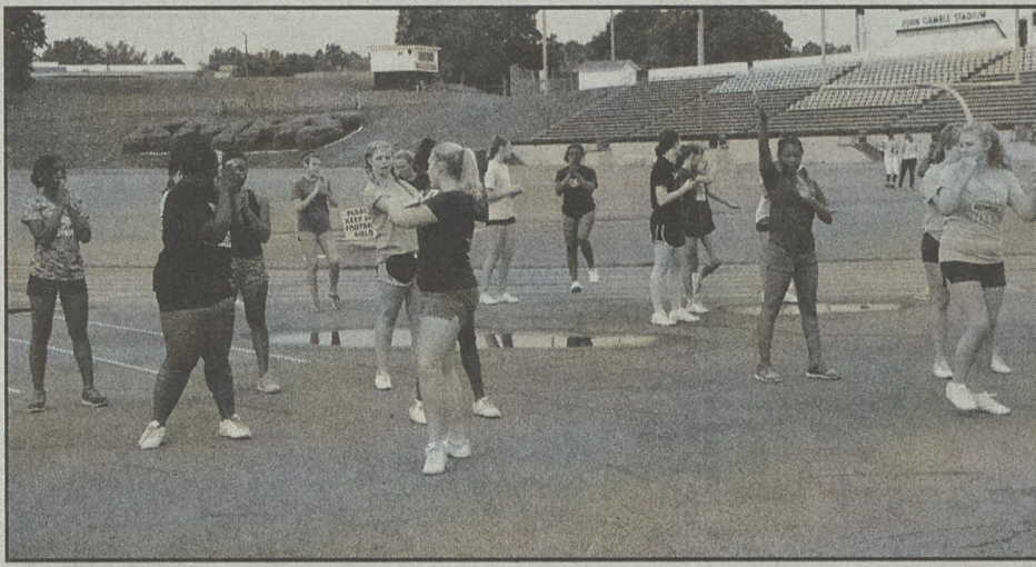
Kings Mountain High cheerleaders (above), and drummers are getting ready for the upcoming football season. They practice each weekday in anticipation of a banner season this fall.