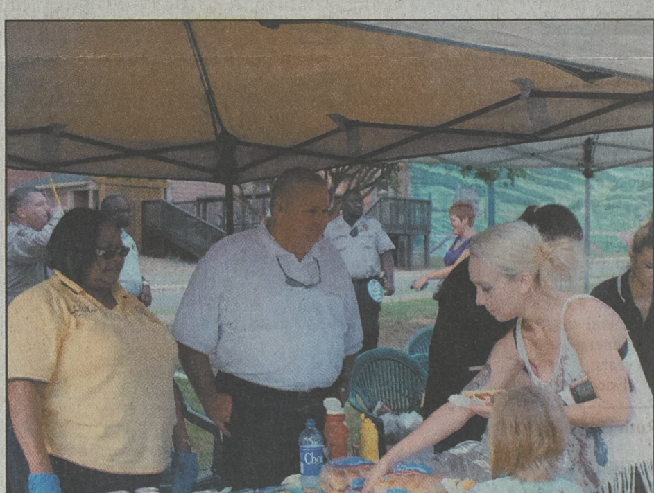
Hot dog giveaway at National Night out.