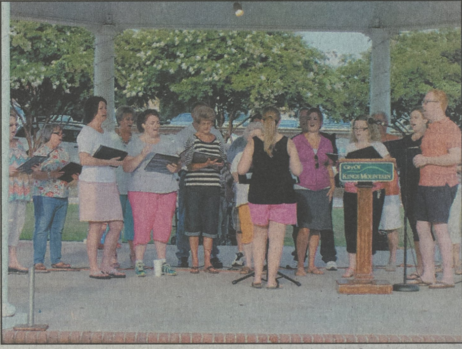
Christian Freedom Choir performs at National Night Out