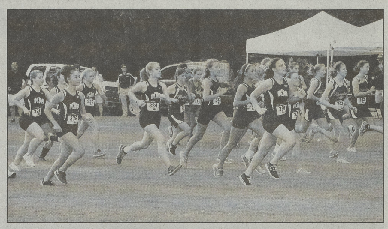
The Lady Mountaineers start off on their cross country run. The Lady Mounties compiled 35 points to defeat East Gaston (47), Ashbrook (57), Crest (94) and Bessemer City (0).

6 p.m. - High school soccer, Kings Mountain at East Burke (Varsity only).