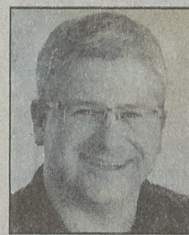
Patrick McHenry US Representative 10th District

This year again I had the pleasure of spending