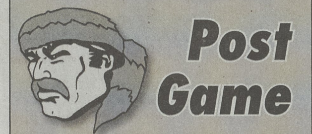
KMHS vs. BURNS September 18, 2015