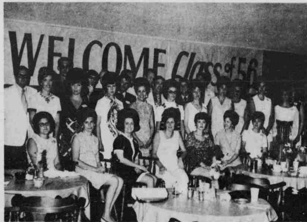
Maiden High School Class Of 1956