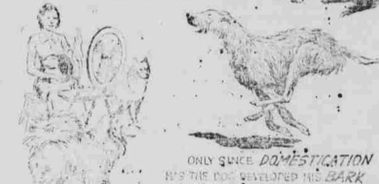
ONLY SINCE DOMESTICATION HAS THE DOG DEVELOPED HIS BARK