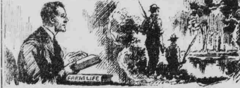
WHETHER THE CITY BOY DREAMS OF LIFE AMID WOODS AND STREAMS AND LEAFY LANES