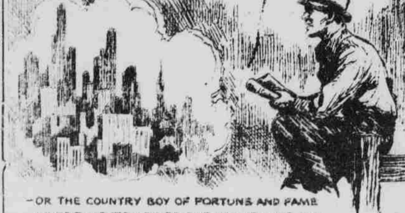
OR THE COUNTRY BOY OF FORTUNS AND FAME WHERE LIGHTS ARE BRIGHT AND TOWERS TALL