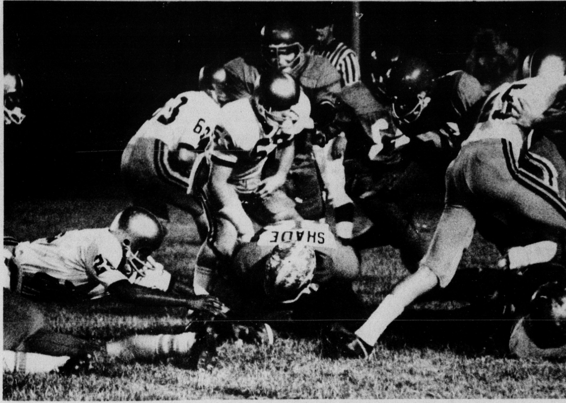
Kings Mountain Loses Fumble Early In Game