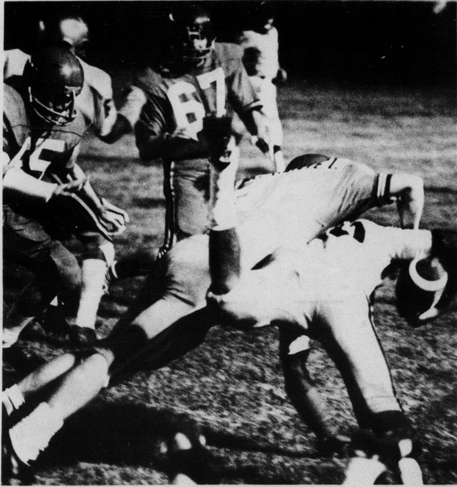
Bulldogging, Cavalier Style!