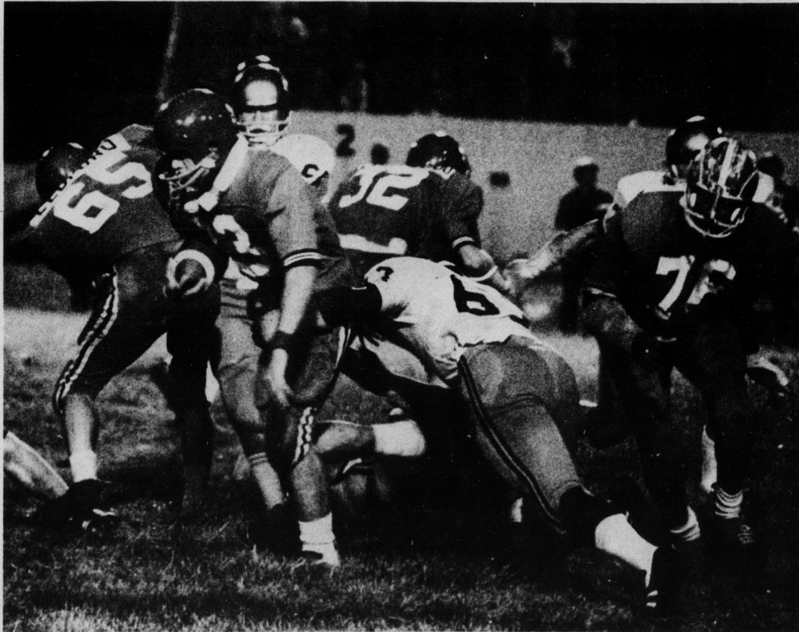
Making Quick Stop On Cavalier Running Back.