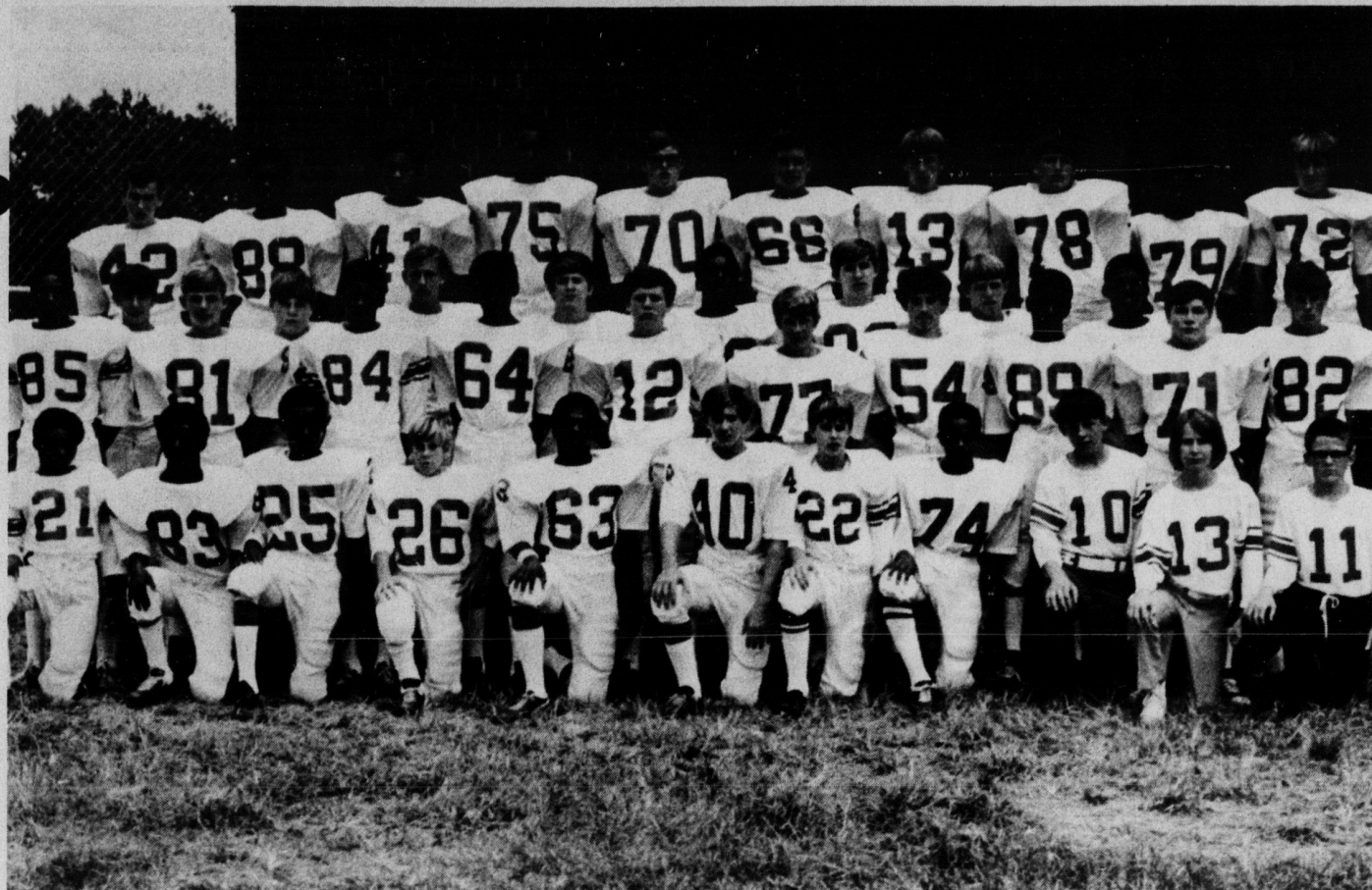
Central Jr. High School Football Team