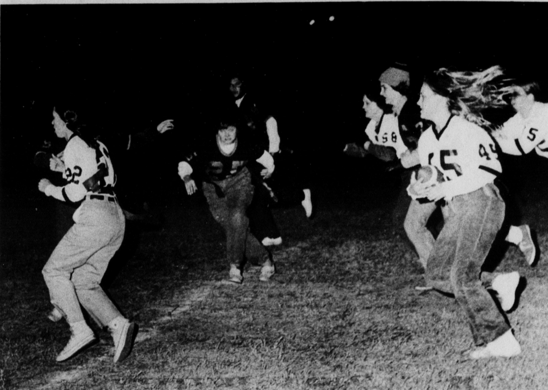
Fleet Footed Females...