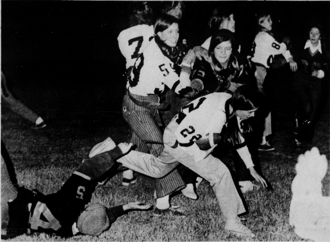
Powder Puff Football Is Not A Contact Sport!