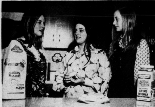
Winners at Kings Mtn. High School Buttermilk Biscuit Contest, sponsored by Carolina Dairy and Eagle Roller Mill.