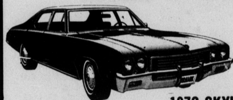
1972 SKYLARK 4-DOOR SEDAN

INCLUDES: Automatic transmission - Power steering - Sonomatic Radio - Fiberglass Belted Whitewall Tires - FACTORY AIR - Tinted Windshield - Bumper Protective Strips - Carpet Savers - Deluxe Wheel Covers - Carpeting front and rear.