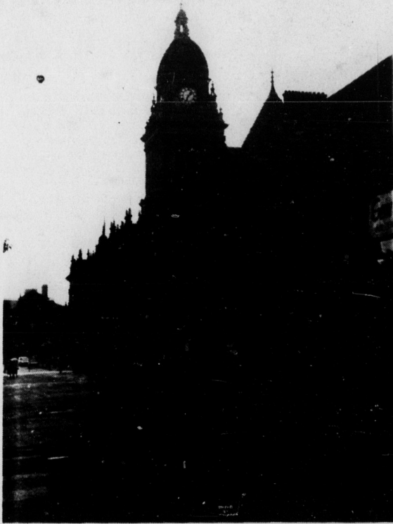
Leeds Town Hall and City Library on a gloomy day.

The Kings Mountain Mirror can be purchased in Grover at Hardin's Grocery, Renn's Cafe and Shorty's Cito.