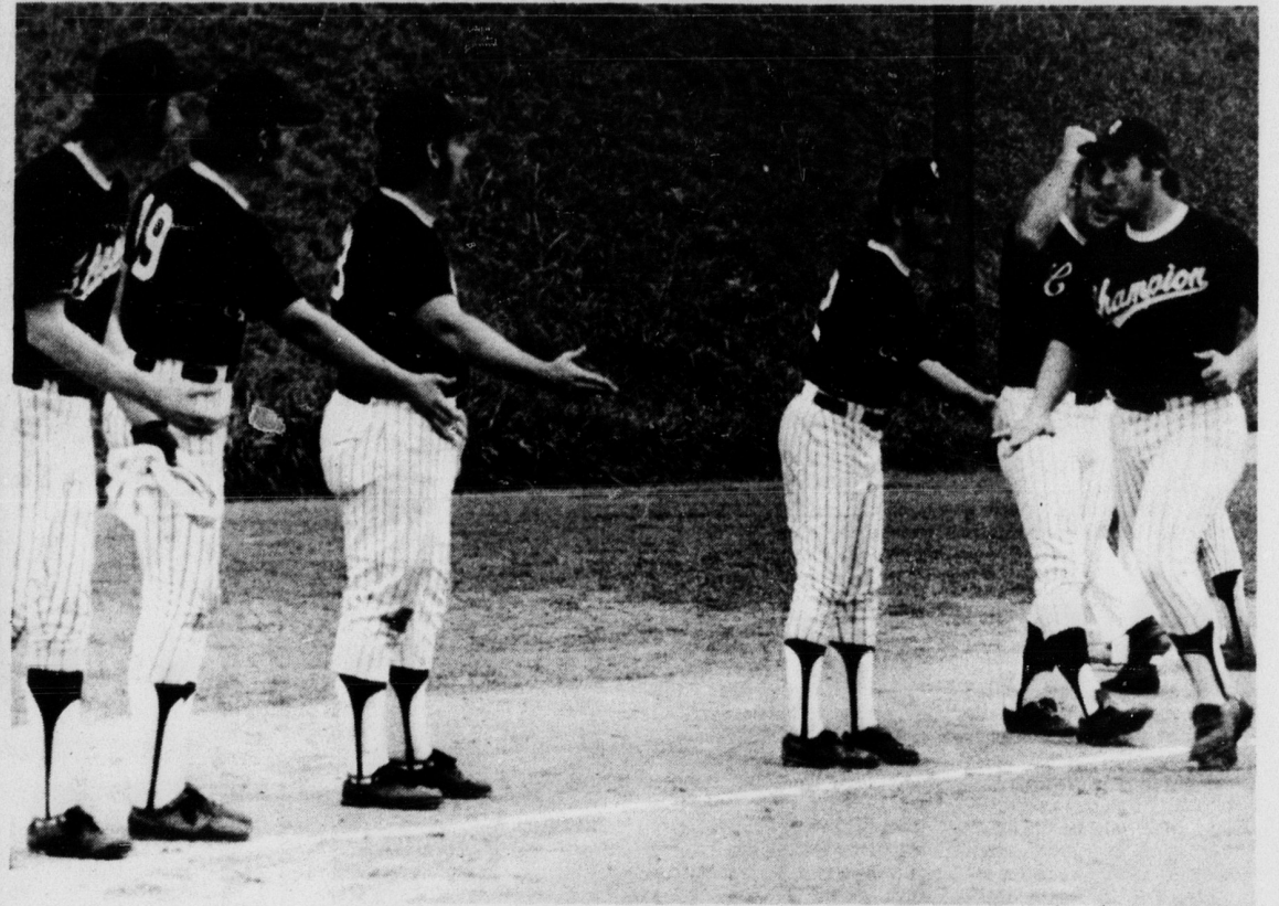
Champion hitter runs all the way...teammates offer congratulations!