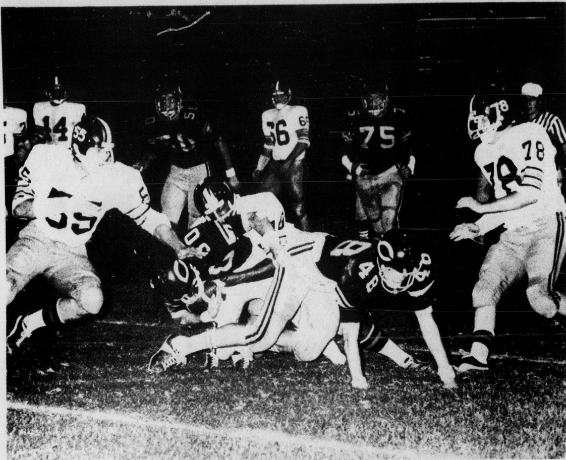
Kings Mtn. On Defense