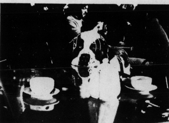
Eating spaghetti can be messy, but this is ridiculous! And it's one of the hilarious moments in "George," a new family comedy from Capital Productions. Marshall Thompson stars, with the title role played by a loveable 250-pound St. Bernard who sulks in bathtubs, likes pigs and suffers from a fear of heights. On the merit of his acting debut, the thoroughbred Saint has been signed by producer-star Thompson to a TV series based on their further Swiss adventures. The series is in production now. "George" the movie opens Monday at the Joy Theater.