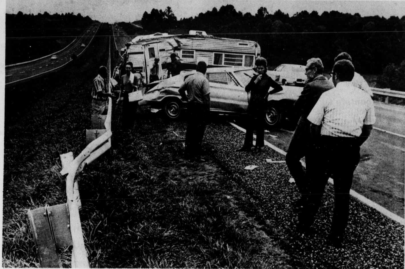
Bystanders view the wreckage of the 1966 Dodge and 1972 Pathfinder Camper it was pulling along I-85 Friday afternoon when it wrecked. The mishap occurred on I-85 1.6 miles south from Kings Mountain between 161 and 216 about 5:00 p. m. Trooper R. B. Burnette of the State Highway Patrol investigated the wreck and reported that Joy Keller Tredinnick, 36, of 6030 Blairmore Street in Fayetteville was traveling north on 85 when a tractor trailer passed the car at a high rate of speed. The driver and three witnesses stated that the wind from the big rig caused Joy Tredinnick to lose control of the