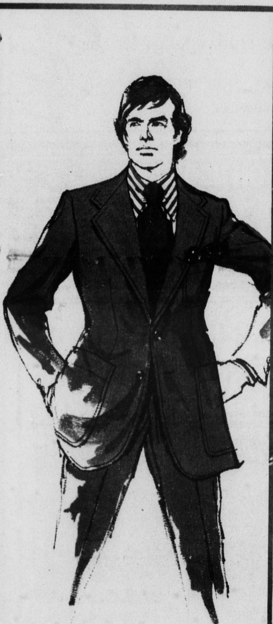
Right anytime: our versatile Texturized Navy Suit by Hart Schaffner & Marx