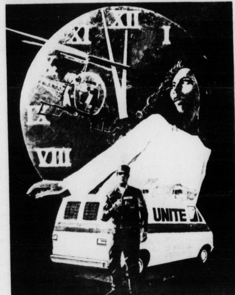
MARK IV PICTURES INCORPORATED PRESENTS