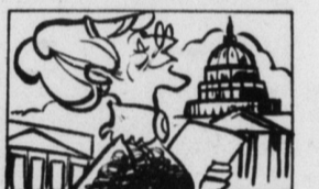
The first Congresswoman was elected in 1917, three years before women could vote throughout the United States.