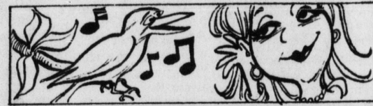
In some places, it's considered good luck to hear a kingfisher on your right.

The ACP Program is available to all eligible producers without regard to race, color, religion, sex or national origin.