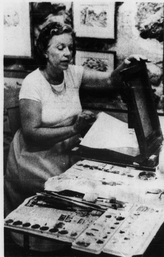
A. B. Demonstrates Her Unique Design

. . . photographer reflects A. B. Snow in picture