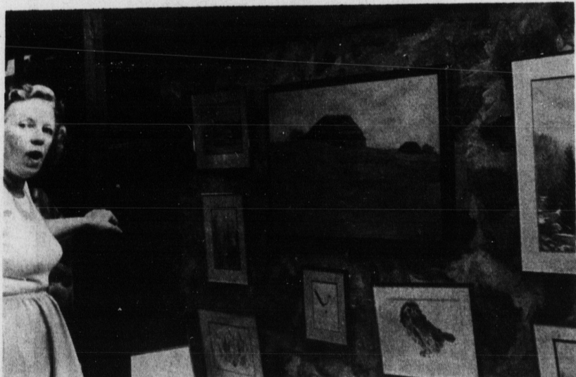
Painting Is A Meaningful Way To Express Oneself