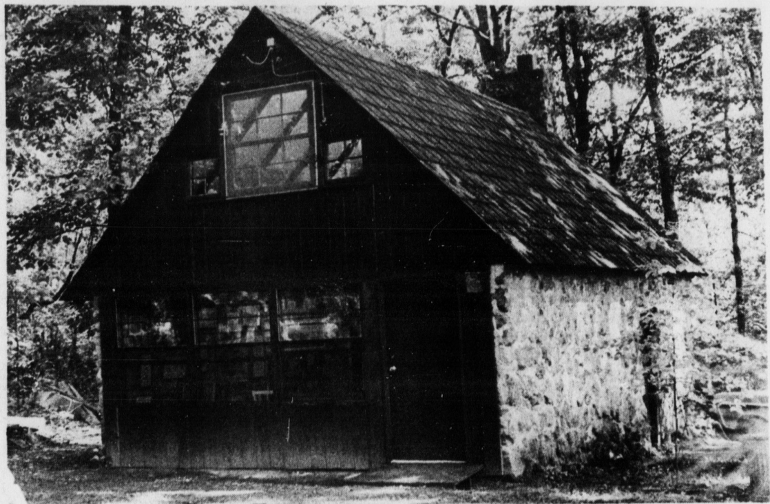
A. B. Originals To Hold Open House Sunday . . . renovated natural rock studio on Margrace Road