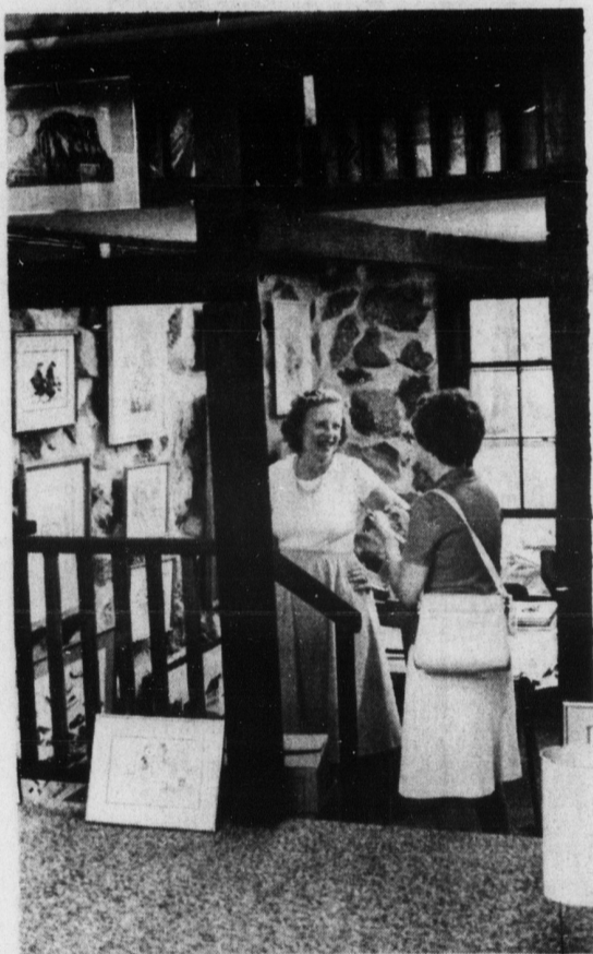
Beauty Of Stone Walls Is Preserved

. . . hundreds of paintings enhance building