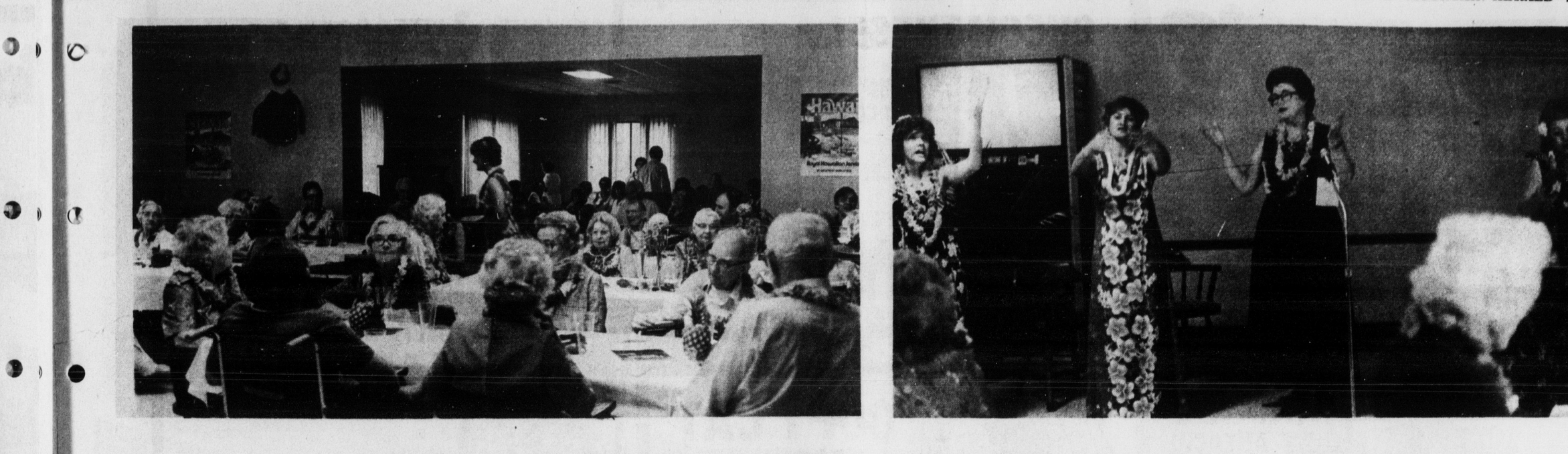
Thursday, October 4, 1979-KINGE MOUNTAIN HERALD-Page 7B

.. FESTIVE LUAU-Residents of the Kings Mountain Convalescent Center held a festive luau Wednesday afternoon featuring Hawaiian decoration, refreshments and colorful