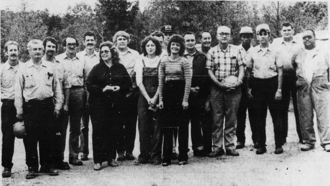
SHOWING OFF THEIR PINS—Pictured are employees of Foote Mineral Co. who received pins commemorating their years of accident-free work at the annual Foote Mineral Barbeque and Safety Awards Presentation held Fri. Nov. 2 at the Services building at the plant.