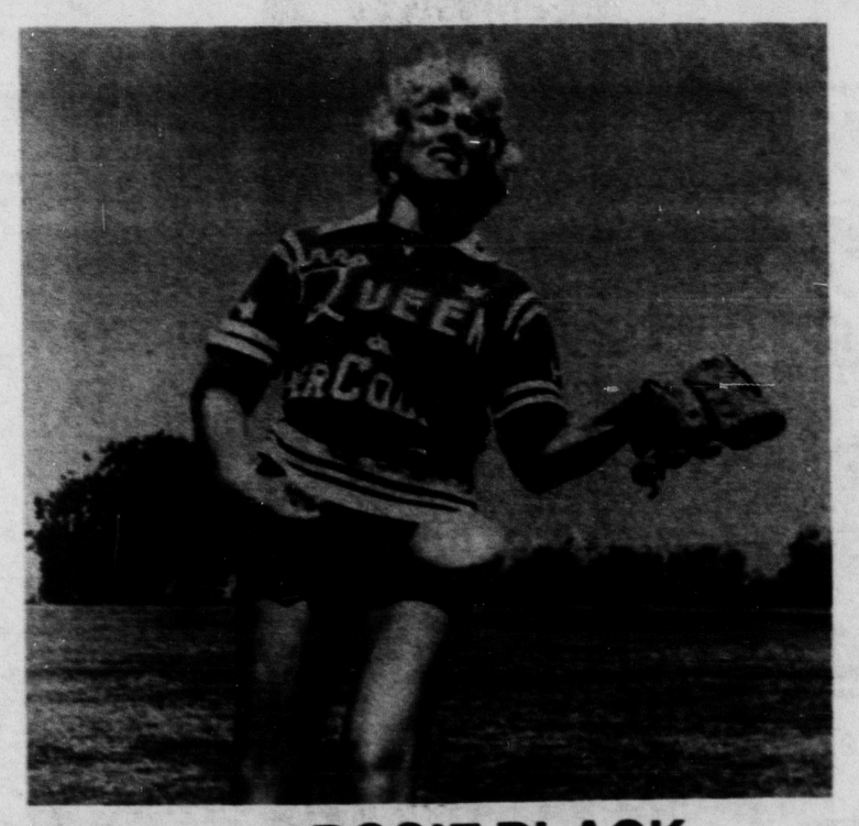
Featuring - ROSIE BLACK World's Greatest Woman Softball Pitcher