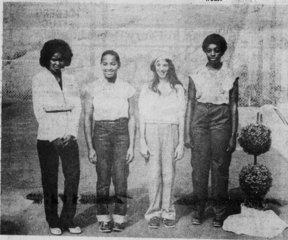
BACK TO SCHOOL - These Senior and Junior High young people model the newest in back to school fashions during a fashion show Saturday at Davidson Park.