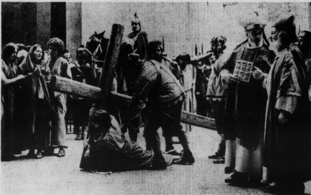
Christ carries the cross...