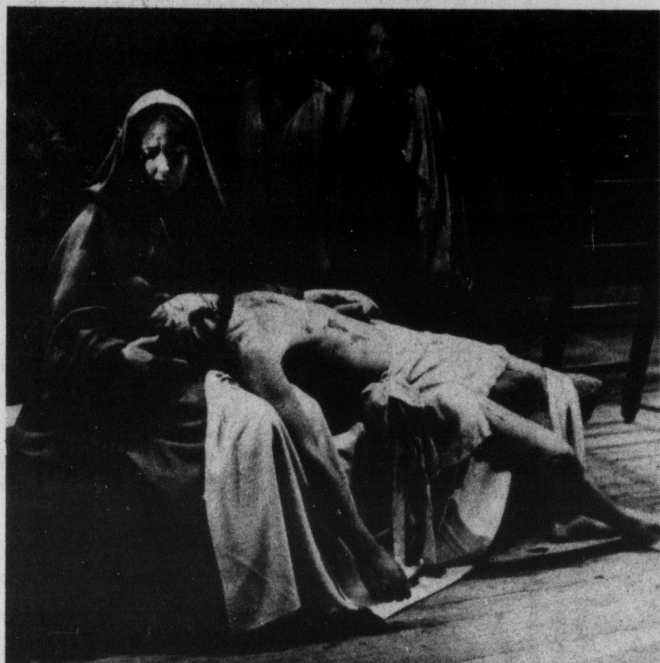
Jesus in the lap of his mother...