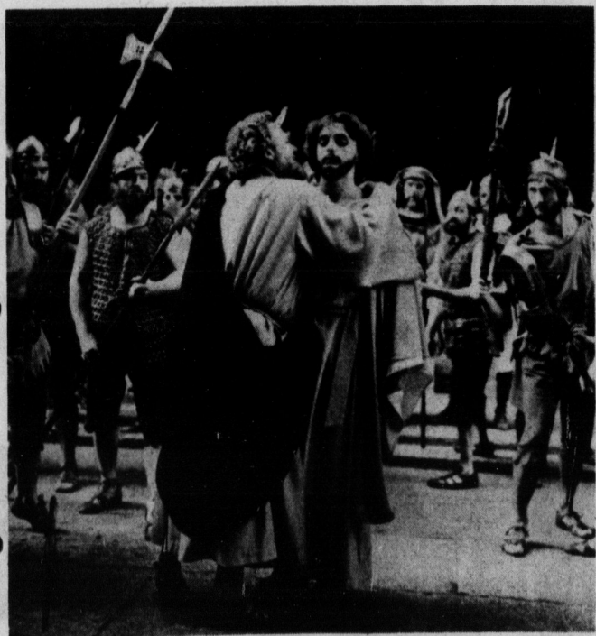
Judas' betrayal kiss...