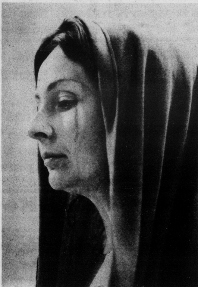
The character Mary...