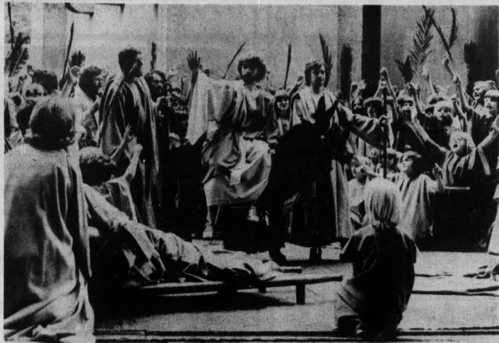
Christ's entry into Jerusalem...