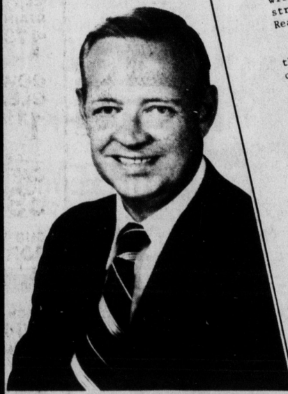
Congressman Jim Broyhill

Jim James T. Broyhill Member of Congress