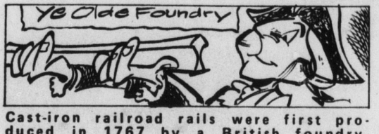
Cast-iron railroad rails were first produced in 1767 by a British foundry.