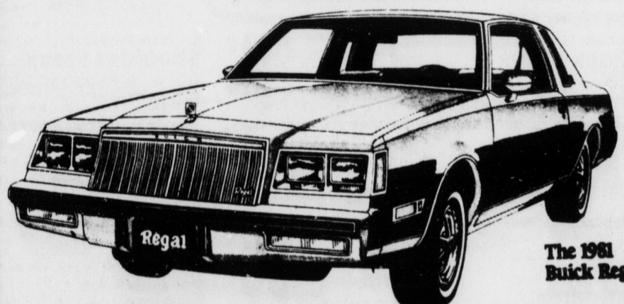
The 1981 Buick Regal

Driving shouldn't be a drag. Our 1981 Regals prove just that.