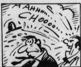
A sneeze can travel as fast as 100 miles an hour.

Units in District 23 include those from Forest City, Spindale, Rutherfordton, Shelby and Kings Mountain.